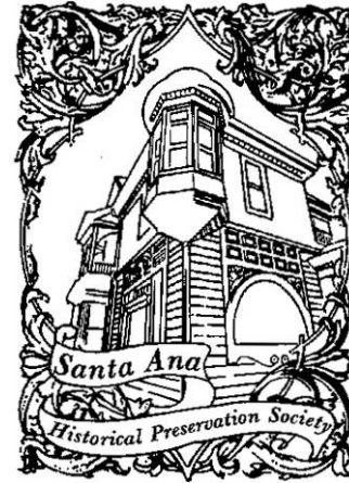
A Legacy of Preservation since 1974.