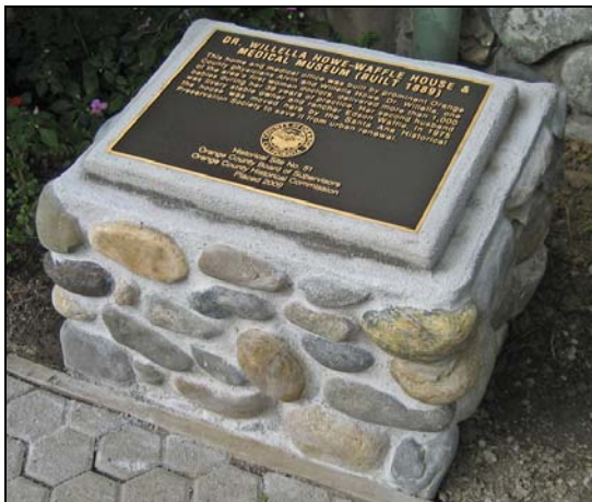
A sneak preview of the just-installed plaque and monument