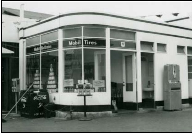
Atkins Service Station, located at 2 nd and Main, during the 1940s.