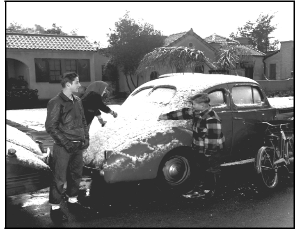
Yes, Virginia, it has snowed in Santa Ana! On January 12, 1949, residents got a surprise when they found their fair city blanketed with the frozen treat.

Please use the form at the back of this newsletter and send in your membership dues today! We appreciate our members, and work hard to make your membership dollars count toward our preservation efforts.