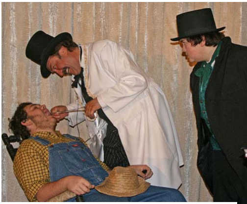
Painless Parker extracts a tooth from a "volunteer."

add to our Cemetery Tour Video Collection. Stay tuned for its release and it to your collection!