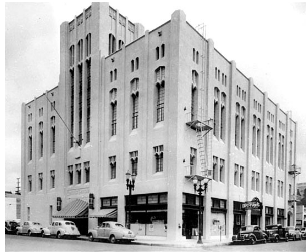
Former Masonic Temple – 1940s?

Dessert – Layered Tuxedo Cake (white cake layered with custard, topped with chocolate)